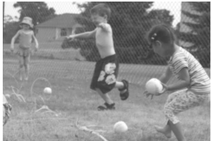
Water play and running through the sprinklers is a Summer School favorite