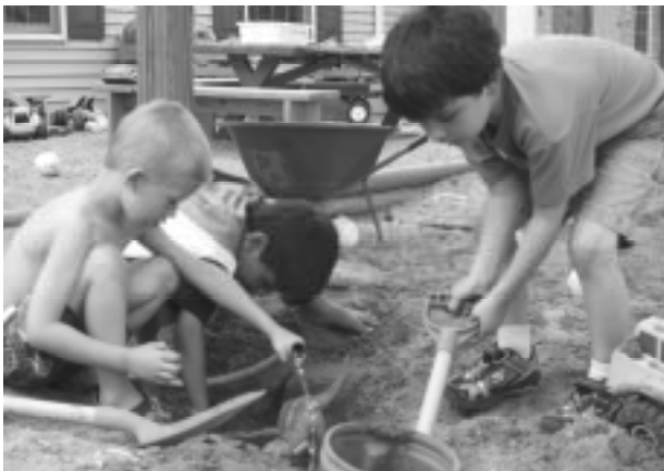
Building dams and rivers is a summer school tradition with many of the children

Summer School topics ranged from “Seuss on the Loose” to “Ocean Commotion” to “Snow Much Fun in the Summer,” to “Summer Olympics.” Children could register for a week at a time. All weeks were full with waiting lists.