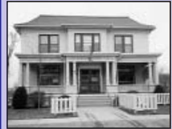
Aldrich Memorial Nursery School 1954 - 1991