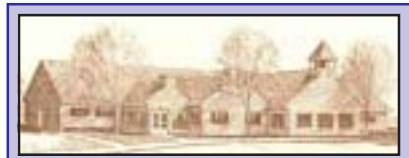
New building in 1991

In the fall of 1991, the Aldrich staff, children and parents moved into our new building at 855 Essex Parkway NW. The school consisted of six classrooms, a main office, director's office, kitchen, storeroom, and playroom. The playground was divided into three separate areas so that each playground was shared by two classrooms. All the classrooms have doors directly to a bathroom, and a door right onto the playground. Eight years later we felt the need to expand, so we built an addition. We added another classroom, an office for the assistant director, a conference room, another playroom, and another larger storeroom.