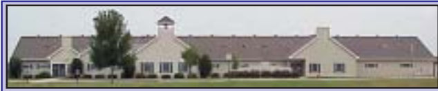
Expansion of New Building in 1999